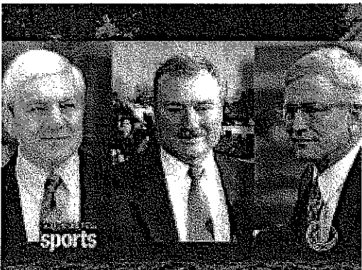
Penn State President Graham Spanier, Senior Vice President Gary Schultz and Athletic Director Tim Curley